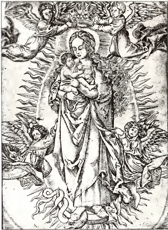
Figure 25. The Virgin of the Apocalypse , after Martin Schöngauer (German, 1445–1491). India, Mughal period, Salim studio, Akbar period, ca. 1599–1605. Album page; ink on paper, image: 12.9 x 9.4, folio: 30.1 x 19.6. Arthur M. Sackler Gallery, Smithsonian Institution; Purchase S1990.57